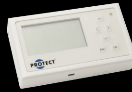
PROTECT IntelliBox IP™ (*)